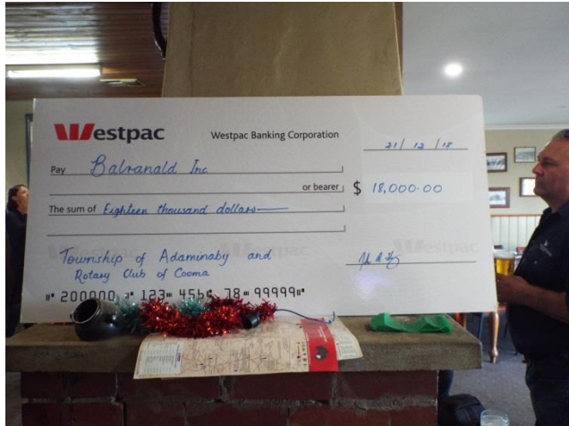
Everyone loves a giant cheque