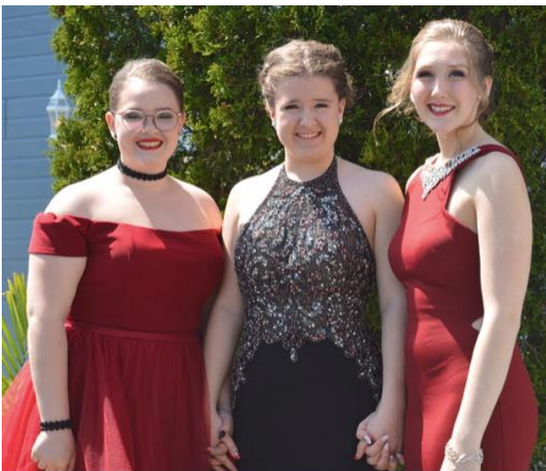
Her hobbies include working to earn money to come on exchange, figure skating which she has been doing since she was 3 or 4 years old, skiing and being part of her school relay team.