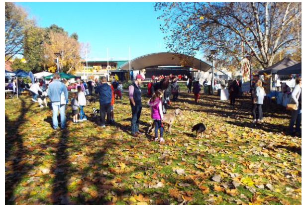
Meeting of presidents and wives, Cooma and Bombala clubs, with AGs