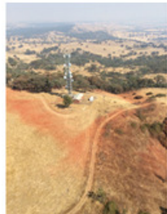
Telecommunications tower, surrounded by fire retardant

Home into the setting sun after 10 hrs flying