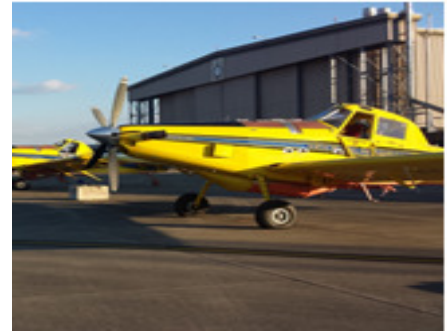
822 Air Tractors, fire bombers