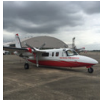
Aero Commander, reconnaissance and lead aircraft