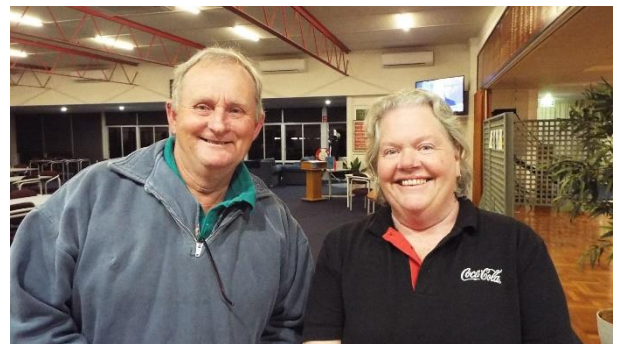
PR with the catering staff

$297.15 has been banked from the 5c. collection. Thank you everyone.