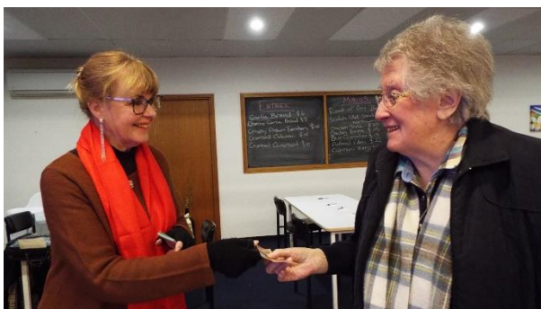
The treasurer at work raising money