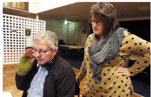
Getting the technology to work!