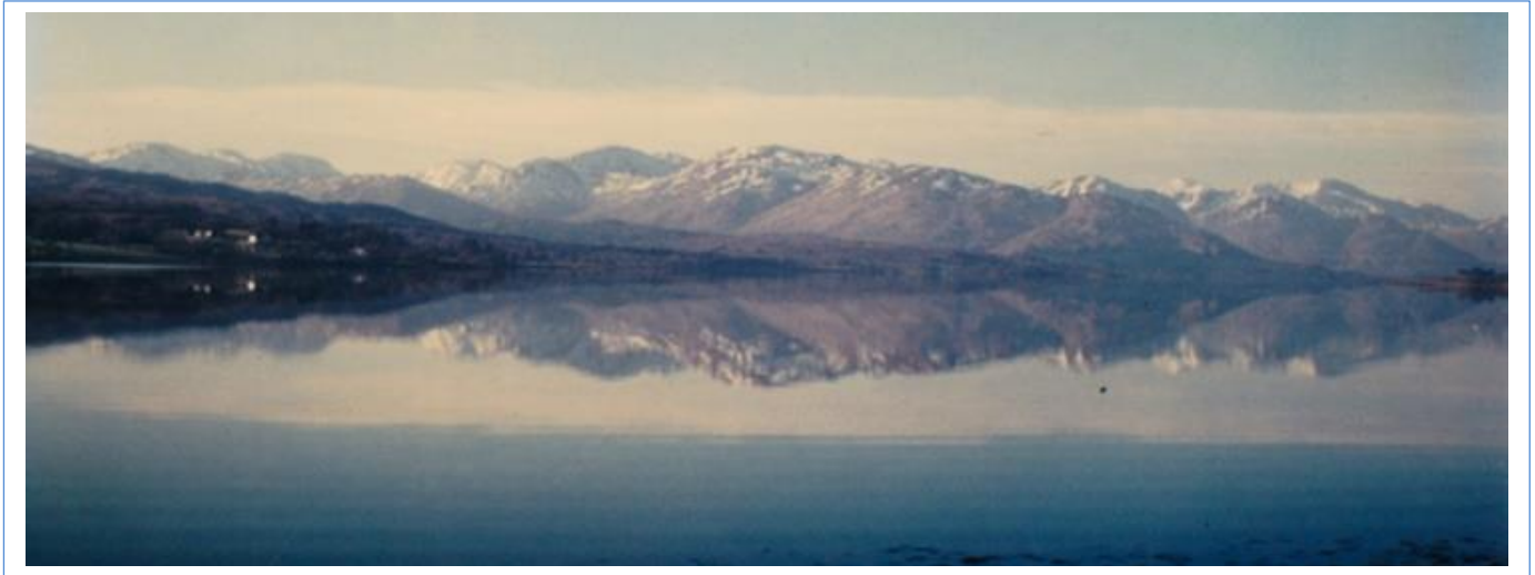
Ben Nevis, Scotland

I became a member of the Snowy Monaro Photographic Group in Jindabyne a couple of months ago, and joined the Group on a photo walk around Providence Portal a couple of weeks ago. The next images showed the effects of the drought, and what water was there on the day.