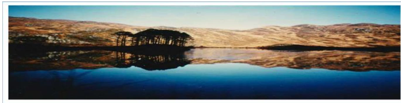
Loch Eil, near Ben Nevis, Scotland. Taken from a moving train