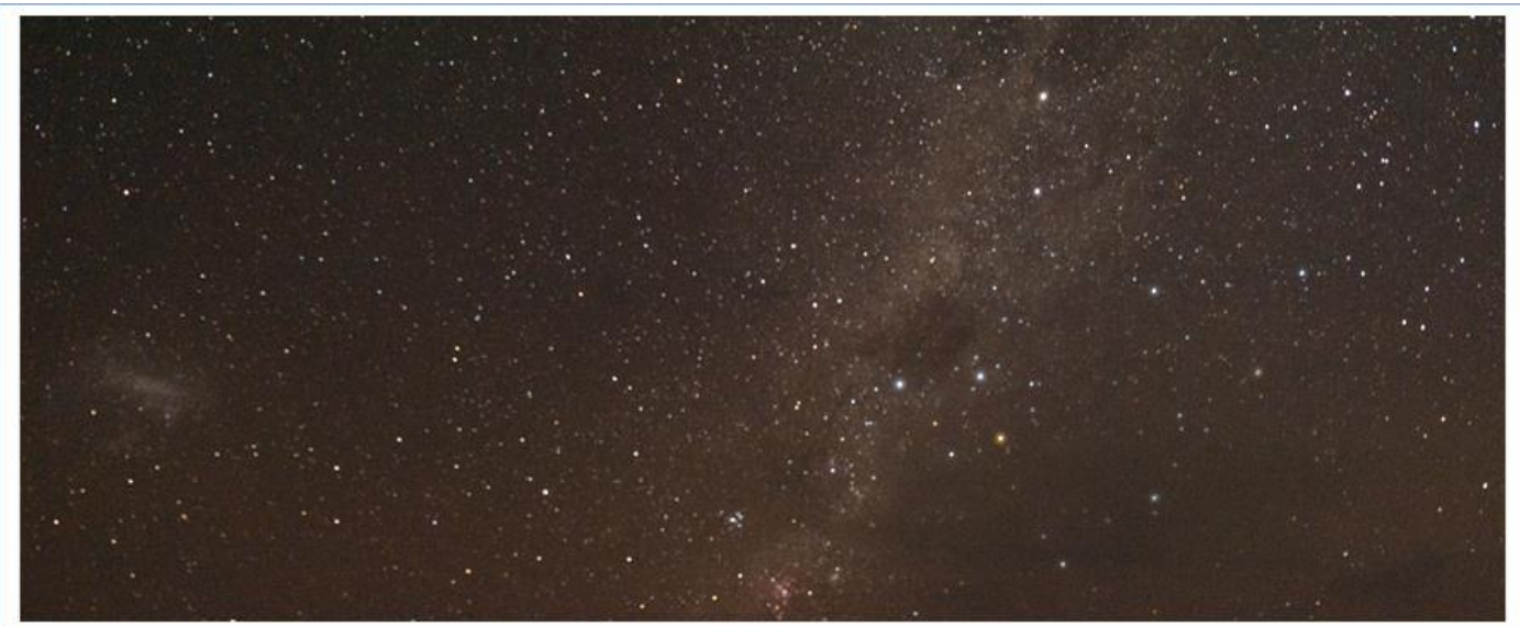
Aurora Australis, South from Mt Gladstone, Sept 2019